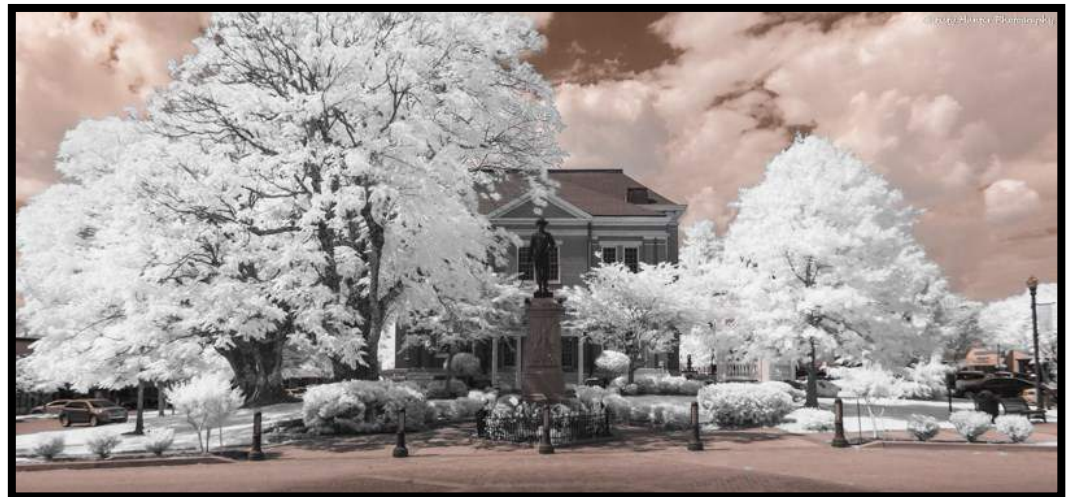
Tipton County Courthouse, Covington, Tennessee

2018 Court Reporting & Captioning Week February 10-17